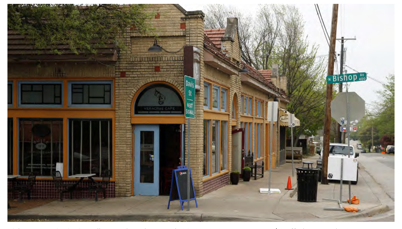
Bishop Arts District in Dallas on Thursday, March 26, 2020.

We think there's power in neighborhoods, and redistricting should not break them up